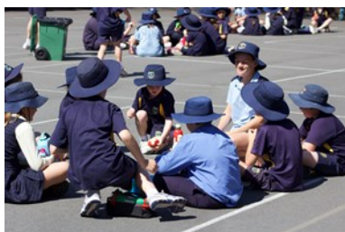
School Feast Day