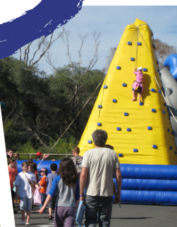
KING OF THE MOUNTAIN 4 YEARS TO ADULT