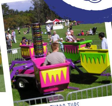
TURBO TUBS 4 YEARS TO ADULT