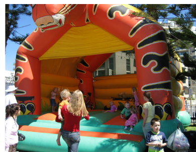
JUMPING CASTLE 3 YEARS TO ADULT