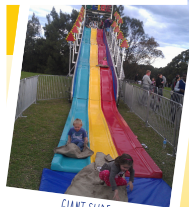
GIANT SLIDE 4 YEARS TO ADULT