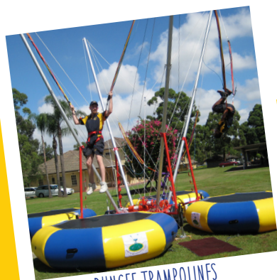
BUNGEE TRAMPOLINES 5 YEARS TO ADULT